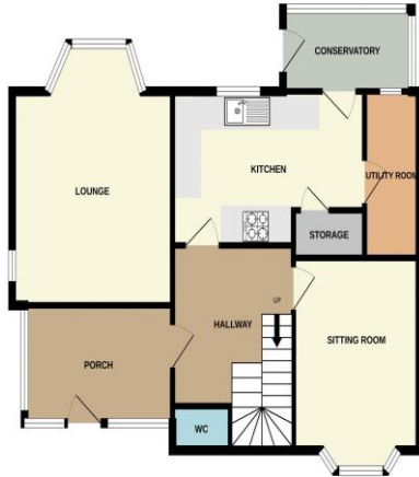
GROUND FLOOR 700 sq.ft. (65.0 sq.m.) approx.